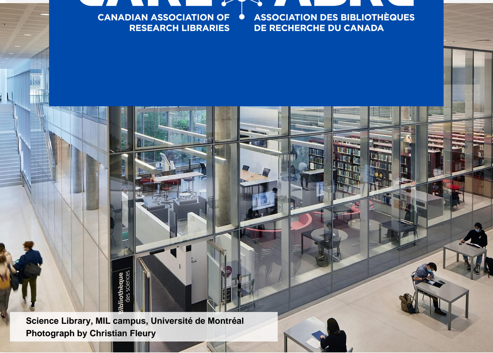
Science Library, MIL campus, Université de Montréal