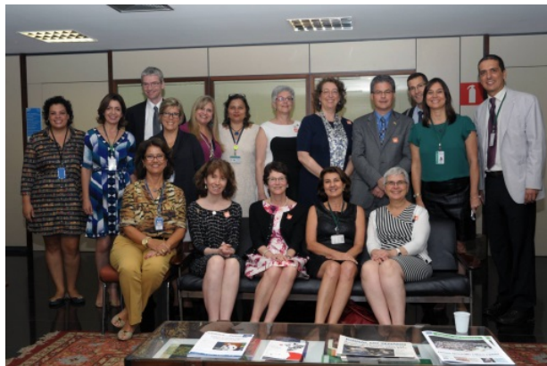
Study tour participants with some of their Brazilian hosts.