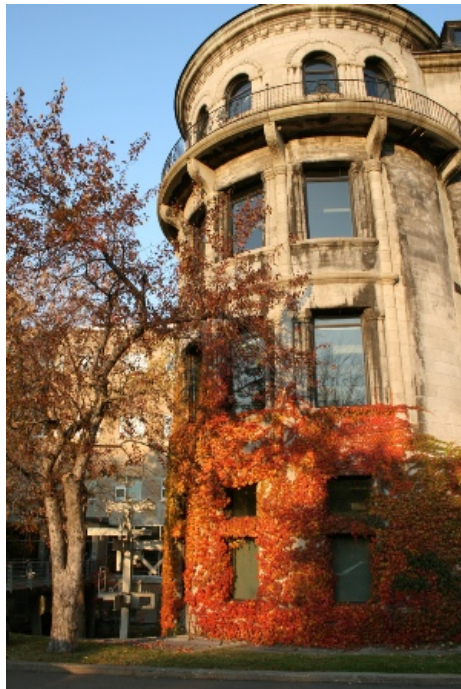
McGill University Library, Schulich Science and Engineering Library

CARL initiated the first survey to assess faculty members' perceptions of university library services in Canada. The findings will be made available in spring 2015.