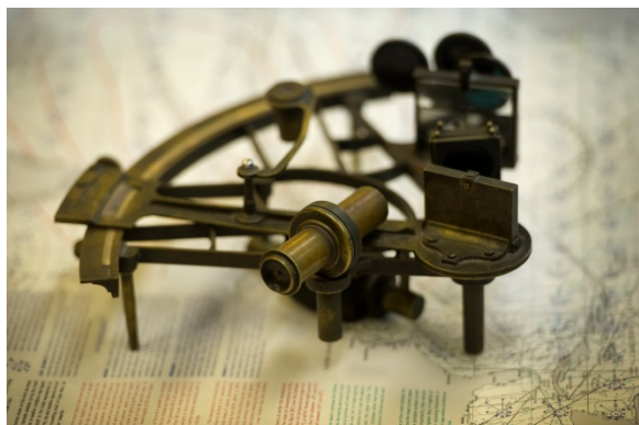
Sextant from the collection of the Dr. C.R. Barrett Library at Memorial University.