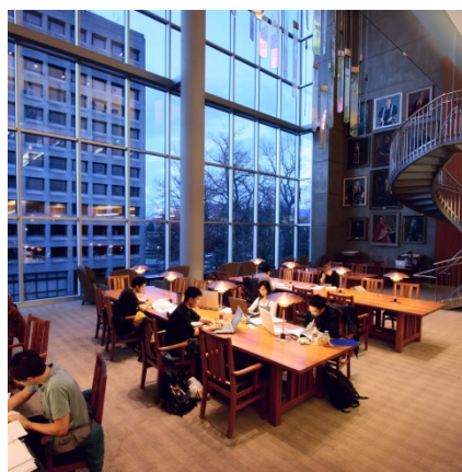
University of British Columbia, Irving K. Barber Learning Centre, Ridington Room