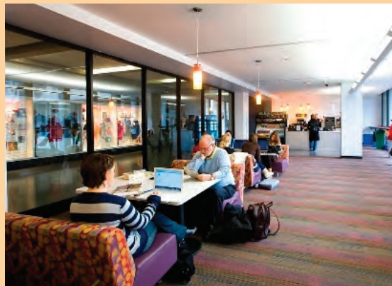
Brock University, Matheson Learning Commons