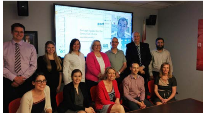
Council of Chairs and Portage Secretariat

Relationships with influential stakeholders in Canadian research landscape were strengthened through collaboration with Tri-Agency member institutions in several initiatives, and contributing to the Leadership Council for Digital Research Infrastructure (LCDRI) reports to Innovation, Science and Economic Development Canada. Links were formed through the development of MOUs with regional library councils.