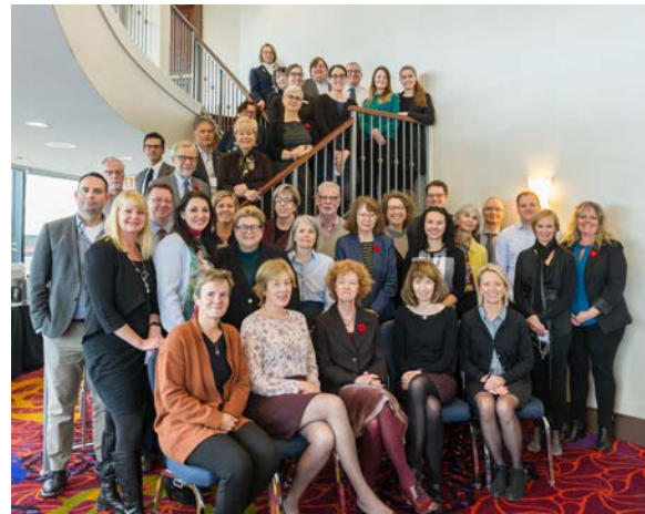
CARL members and staff at the 2017 Fall General Meeting in Ottawa.

The 2017 CARL Fall Meeting convened November 7-9, in Ottawa, and included sessions on LCDRI and Research Data / Portage, Copyright and Advocacy, Strengthening Indigenous representation and reconciliation, and 'Coalition-publi.ca' / SPARC Open Education Leadership Program. Members also participated in meetings on Parliament Hill, after a keynote speech by David Lametti.