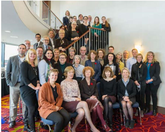
CARL members and staff at the 2017 Fall General Meeting in Ottawa.

The 2017 CARL Fall Meeting convened November 7-9, in Ottawa, and included sessions on LCDRI and Research Data / Portage, Copyright and Advocacy, Strengthening Indigenous representation and reconciliation, and ‘Coalition-publi.ca’ / SPARC Open Education Leadership Program. Members also participated in meetings on Parliament Hill, after a keynote speech by David Lametti.