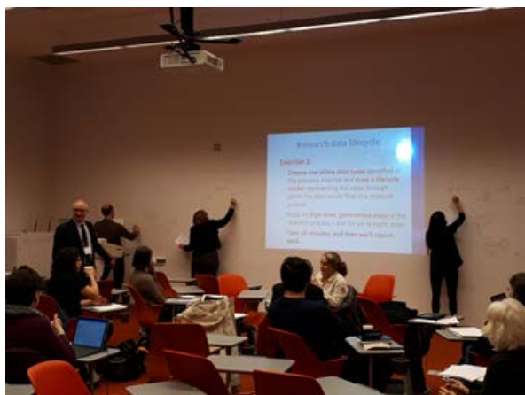
RDM in Canada Event in Toronto

The Federated Research Data Repository (FRDR), guided by its Steering Committee composed of members from CARL-Portage and Compute Canada, continued its development, transitioning from alpha through beta testing, and into limited production mode.