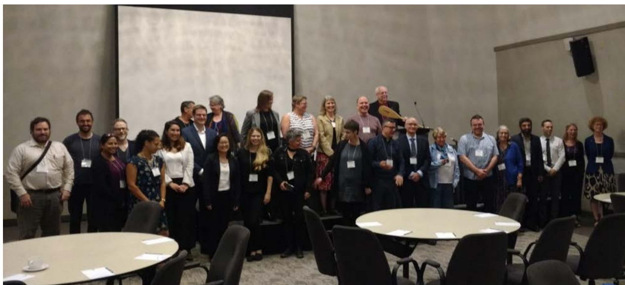
Portage Network of Expertise at RDM in Canada Event in Montreal

In step with this expansion of working groups, the Portage network grew from 42 volunteers at the end of 2016, to over 110 volunteers from nearly 40 research institutions from across Canada.