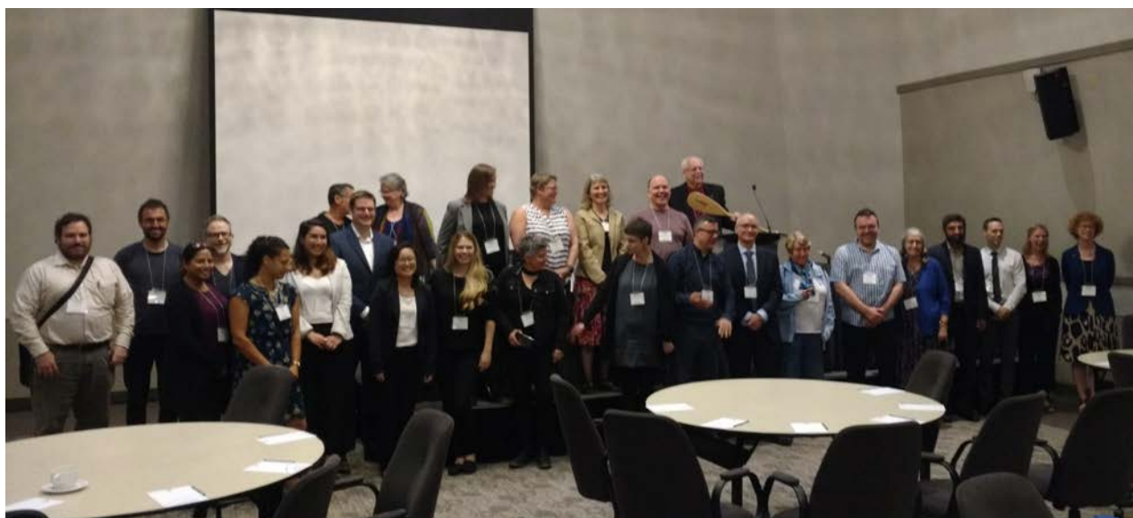
Portage Network of Expertise at RDM in Canada Event in Montreal

In step with this expansion of working groups, the Portage network grew from 42 volunteers at the end of 2016, to over 110 volunteers from nearly 40 research institutions from across Canada.