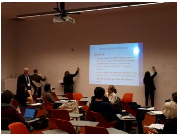
RDM in Canada Event in Toronto

The Federated Research Data Repository (FRDR), guided by its Steering Committee composed of members from CARL-Portage and Compute Canada, continued its development, transitioning from alpha through beta testing, and into limited production mode.