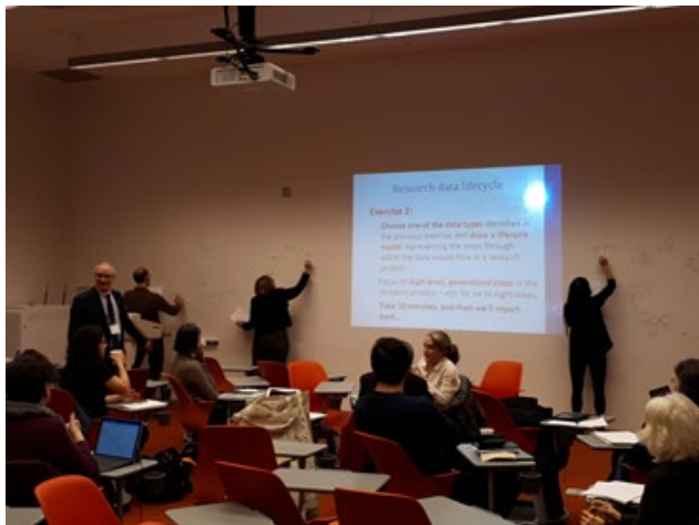
RDM in Canada Event in Toronto

The Federated Research Data Repository (FRDR) was awarded resources in Compute Canada's Research Platforms and Portals Competition and is now in limited production mode and continues to work towards full production. Toward this end, a privacy consultant was hired to review draft operational policies, privacy policies, and terms of use.