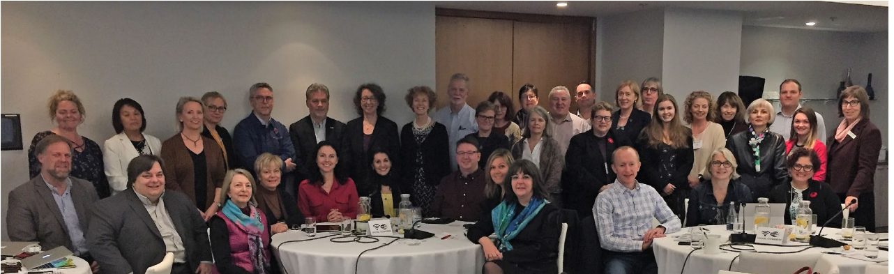
CARL members and staff at the 2018 Fall General Meeting in Montreal.

The 2018 CARL Fall Meeting convened November 6-8, in Montreal, Quebec, and featured a strategic planning session, a copyright debrief, and presentations on Portage, the CARL statistics program, CARL competencies, and diversity.