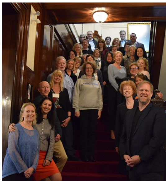
CARL members at the 2019 Spring General Meeting in Victoria, BC.

Library and Archives Canada National Research Council Canada, National Science Library