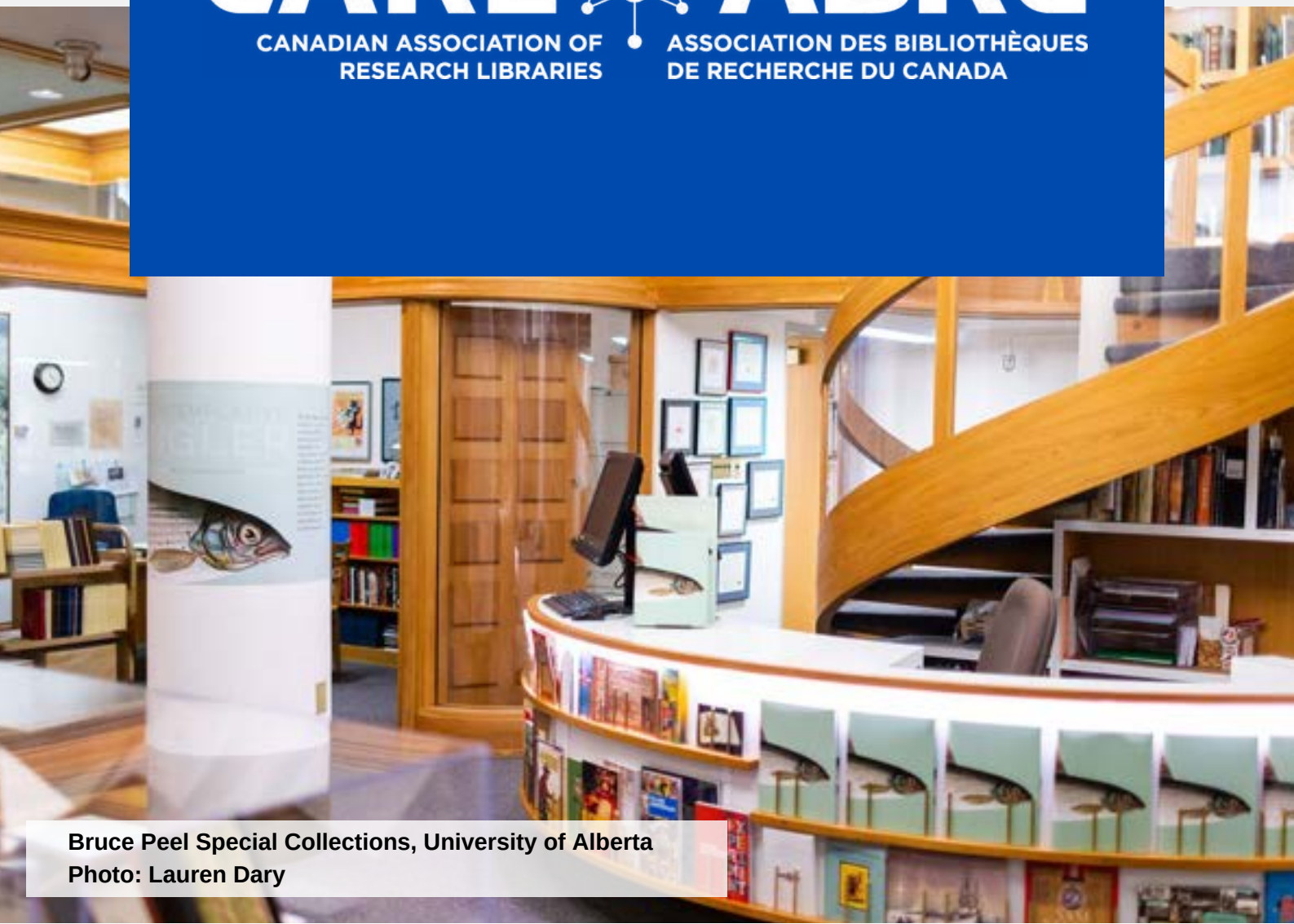
Bruce Peel Special Collections, University of Alberta