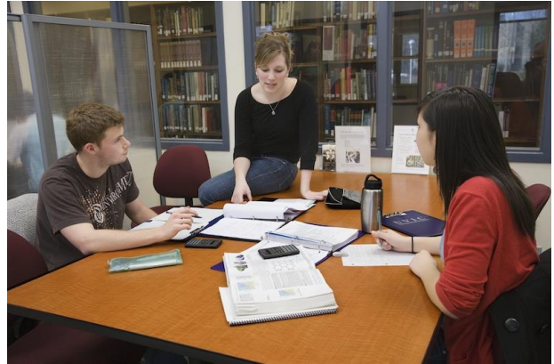
McPherson Library, University of Victoria.

CARL signed on to the Hague Declaration on Knowledge Discovery in a Digital Age in May 2015. The Declaration pertains to text and data mining, and was spearheaded by CARL's peer organization for Europe, LIBER.