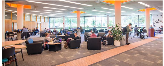
McLaughlin Library, University of Guelph.

In December, CARL received just under $47,000 in funding from Library and Archives Canada through the Documentary Heritage Communities Program for the first phase of 'The Student Voice,' an online portal to growing historical collections of post-secondary student media, in both French and English, drawn from the holdings of CARL member libraries and student bodies across the country. While this first phase of the project will focus on planning and proof-of-concept, including the development of the platform with Canadiana.org, the project's ultimate goal is to encourage and support more of our members and Canadian student organizations to preserve digitally, aggregate and make accessible these hidden collections.